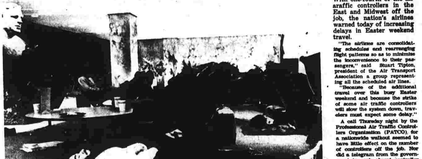
Some passengers on the floor, others prefer chairs. They are passengers awaiting departure of their flights this morning at LaGuardia Airport, which has experienced flight delays.

Fair and colder tonight with low in 30s. Tomorrow fair, high about 50. Sunday's outlook — becoming cloudy.