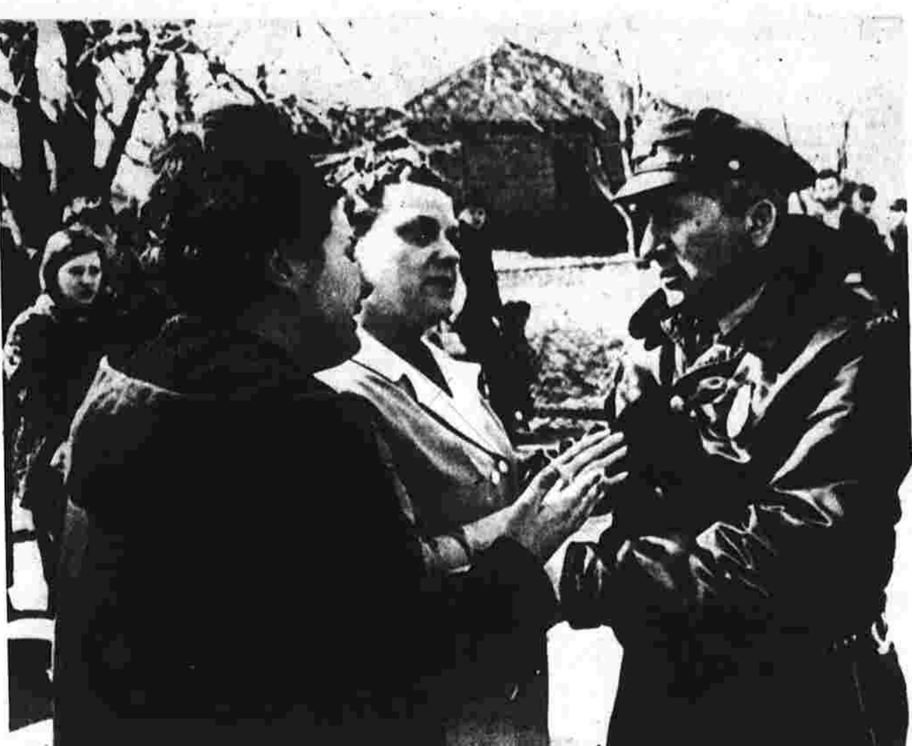
Unidentified Enfield auxiliary officer comforts four young people found murdered in an Enfield apartment early yesterday.

The new movement—successor to the Civil Rights Drive of the early 1960s and the War on Poverty of the mid-60s—is not expected to stop at the end of Earth Day. Already, organizations to reclaim the environment have been formed at 3,000 high schools and 2,000 colleges.